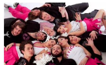
Bling Kong

The event is organized by the Wexner Center's 12 ¼ Circle (a volunteer group of young professionals) and other community leaders, and will benefit the Wexner Center's family and children's programs .