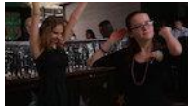
How to Dance in Ohio

This touching documentary follows a group of autistic Columbus teenagers and young adults as they prepare for a spring formal. Focusing on three young women as they go through an iconic American rite of passage, the film offers intimate access to the lives of people who are often unable to share their experiences with others. Director Shiva shows the daily courage of people facing their fears and opening themselves to the pain, worry, and joy of the social world. A conversation with the filmmakers and many of the film's subjects follows the screening. (89 mins., DCP)