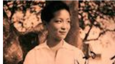
Golden Gate Girls

Cosponsored by Ohio State's Departments of Women's, Gender, and Sexuality Studies and East Asian Languages and Literatures.