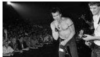
The Decline of Western Civilization

$10 general public, $8 Wexner Center members, students, and senior citizens