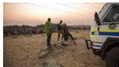
Miners Shot Down

The gripping documentary Miners Shot Down explores a