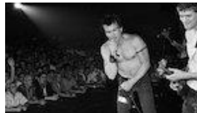
The Decline of Western Civilization

$10 general public, $8 Wexner Center members, students, and senior citizens