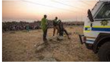
Miners Shot Down

The gripping documentary Miners Shot Down explores a 2012 “wildcat” strike in one of South Africa’s biggest platinum mines. Six days into the spontaneous employee action, the police used live ammunition to suppress it, killing dozens and injuring even more. (86 mins., HD video) Cosponsored by Ohio State’s Departments of African American and African Studies, Comparative Studies, and the Center for African Studies.