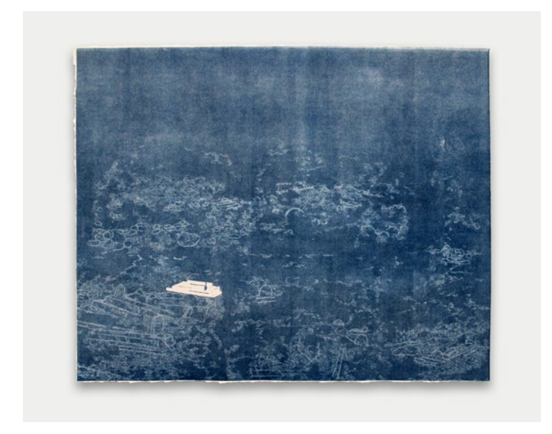
TOP A, 2022. Monotype on Velin BFK Rives, 21¾ x 27 in. BOTTOM B, 2022. Monotype on Velin BFK Rives, 21¾ x 27½ in. Courtesy of the artist, printed at Columbus Printed Arts Center, Ohio.