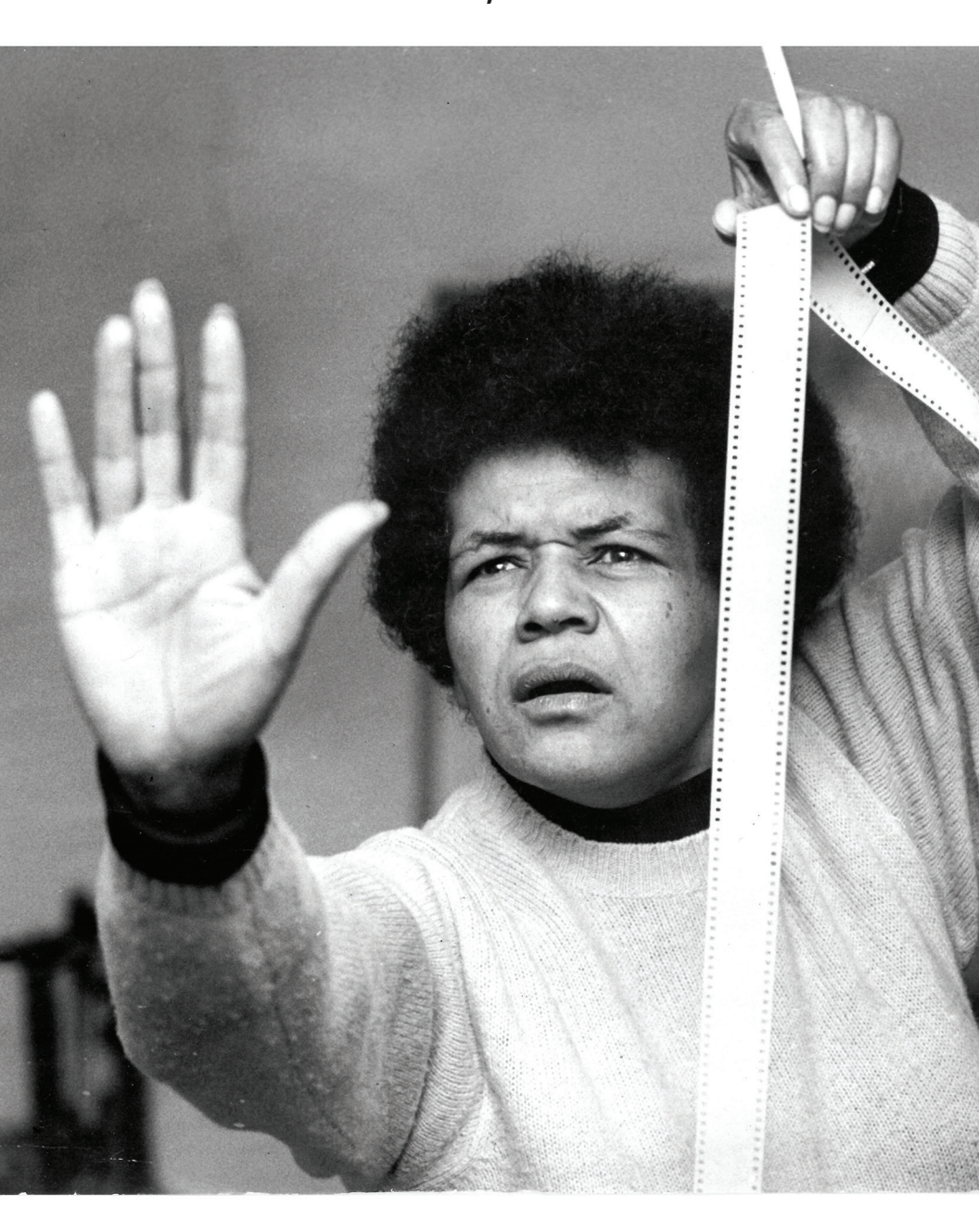
wexner center for the arts at the ohio state university