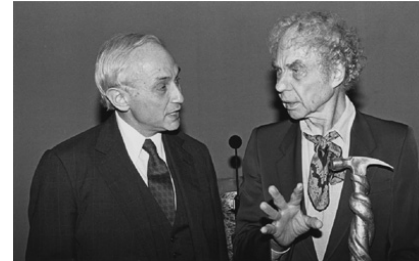
Leslie H. Wexner and Merce Cunningham at the 1993 Wexner Prize ceremony at the Wexner Center for the Arts

http://wexarts.org/wexblog/?s=merce+cunningham