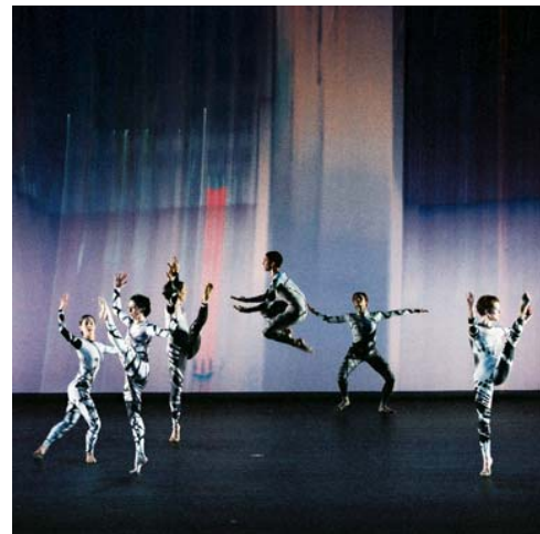
Above, MCDC in Split Sides ; at left, Merce Cunningham

The Legacy Tour will be audiences' last opportunity to see Cunningham works performed by the superb dancers he personally trained. At the conclusion of the world tour, the company will disband permanently, closing an important chapter in this country's creative legacy. Showcasing two pieces spanning Cunningham's rich career, the evening draws from the master's early work and later choreography. The program features Crises from 1960, a piece set to music composed for player pianos by American maverick composer Conlon Nancarrow with costumes by Robert Rauschenberg, and Split Sides , a recent work with an electronic score