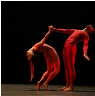
Above: MCDC in Crises. Below: MCDC in Split Sides