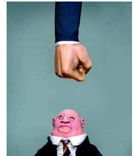
Famous Puppet Death Scenes

With their hit production Famous Puppet Death Scenes , Canada's Old Trout Puppet Workshop offers a panorama of puppet murder, mayhem, and most unfortunate misadventure. In approximately 80 minutes the audience is treated to over 24 scenes of puppet demise ranging from a German game show to a 19 th -century opera house, selected from the greatest shows in puppet history. The colorful characters range from comic gobs of goo, to an egg-shaped puppet named Nordo Frot threatened by the arm of Fate (see inset), to four aliens with Johnny Depp faces. The clever, mechanical staging, poignant soundtrack, costumes, and light design combine to bring the puppets and their stories vividly to life. Called "weird and wonderful...by turns comic, macabre and sublimely surreal" by the Globe and Mail (Canada), the show is a scintillating and satisfying fest of irony. The Old Trout Puppet Workshop was founded on a ranch in Alberta in 1999 and is now based in Calgary; for more information, visit www.theoldtrouts.org .