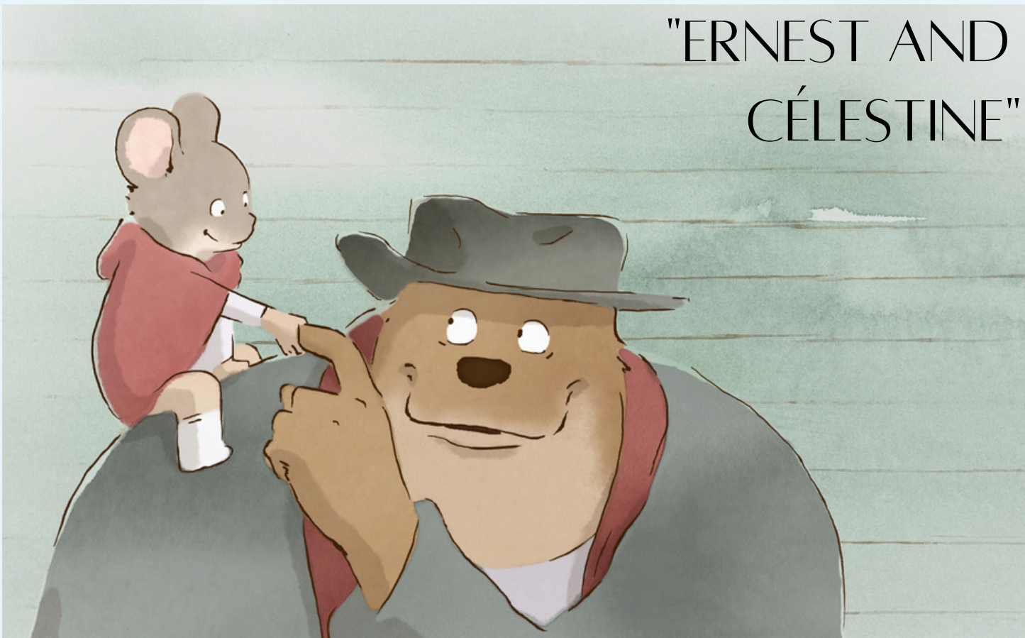
"ERNEST AND CÉLESTINE"

A heartwarming story of adventure and the power of friendship, "Ernest and Célestine" tells of the bond between an unlikely pair and how kindness and hope can transcend all.